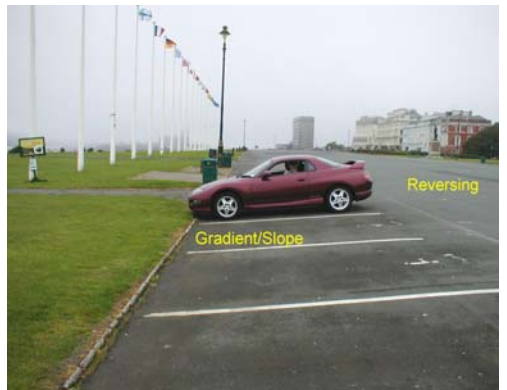
Photograph F- Overall viewpoint of Hazards