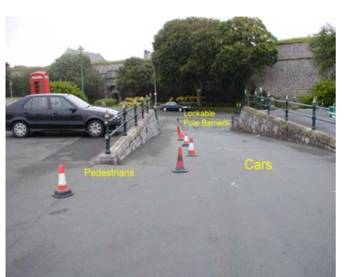
Photograph C- Overall viewpoint of Hazards

5.1 The Principal Parks Services Manager and the Corporate Health and Safety Officer submitted the background material detailed in Section 8.0 and informed the Committee on 25<sup>th</sup> November 2003 –