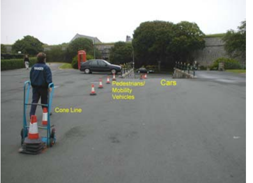
Photograph D- Overall viewpoint of Hazards